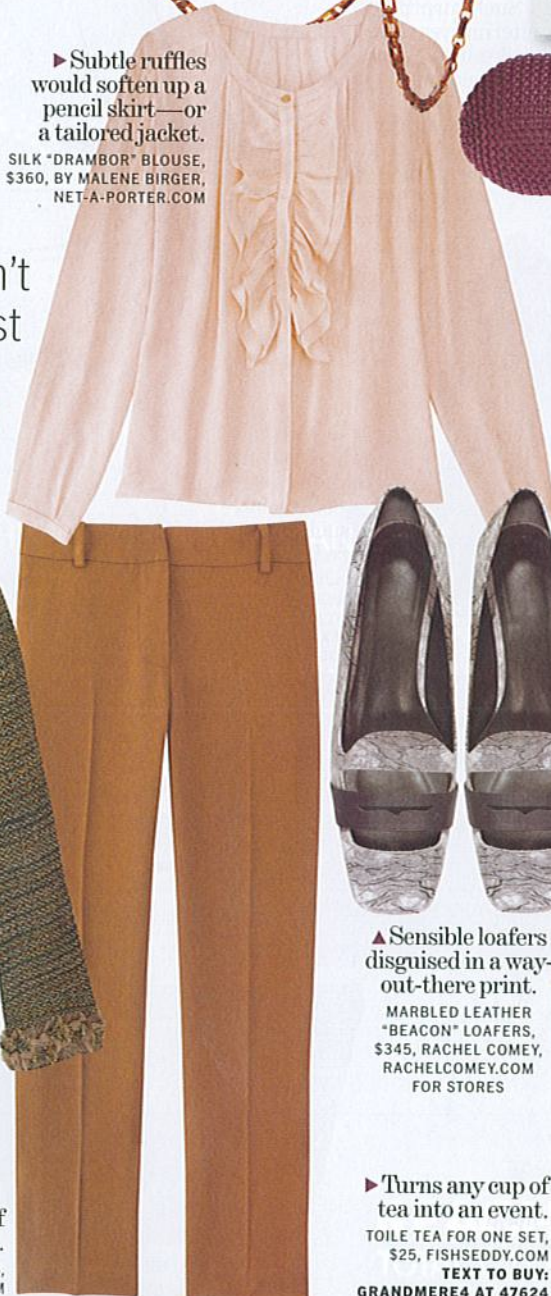
SILK "DRAMBOR" BLOUSE, $360, BY MALENE BIRGER, NET-A-PORTER.COM

▶ Subtle ruffles would soften up a pencil skirt—or a tailored jacket.