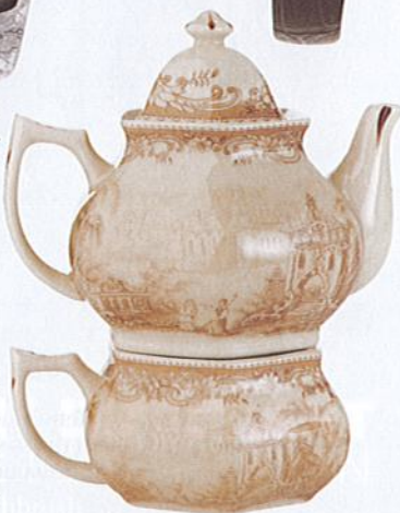
TOILE TEA FOR ONE SET, $25, FISHSEDDY.COM TEXT TO BUY: GRANDMERE4 AT 47624

JACQUES LAFITTE. STILL LIVES. LUCKY DIGITAL STUDIO. *YOUR CARRIER'S STANDARD MESSAGING RATES APPLY TO ALL SMS CORRESPONDENCE. OTHER CHARGES MAY APPLY. AVAILABLE ON PARTICIPATING CARRIERS AND IN THE U.S. ONLY. FOR COMPLETE MOBILE TERMS AND CONDITIONS, PLEASE GO TO WWW.LUCKYMAG.COM/GO/TEXT.