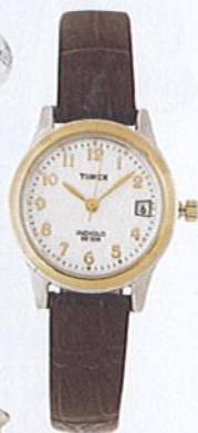
WATCH, $50, TIMEX.COM TEXT TO BUY: GRANDMERE3 AT 47624

▶ The pants equivalent of a luxe, well-cut coat.